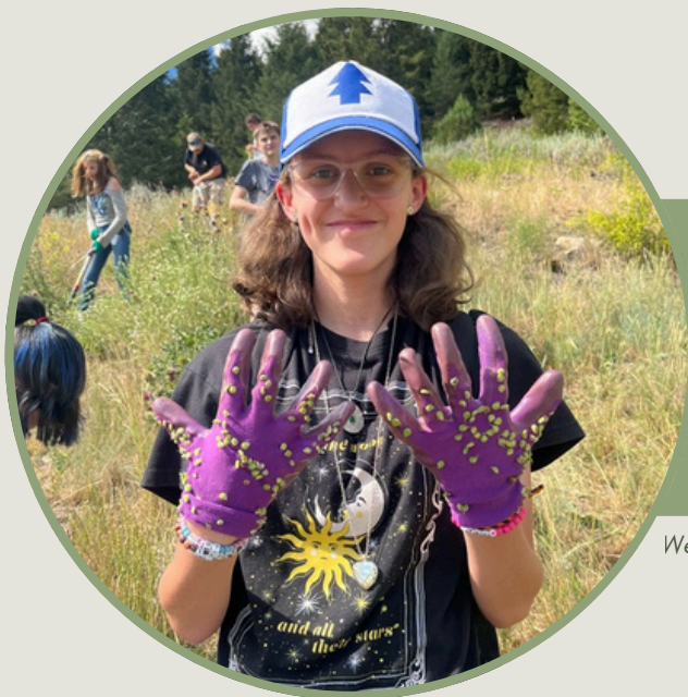
Weed pull with Big Sky Youth Empowerment