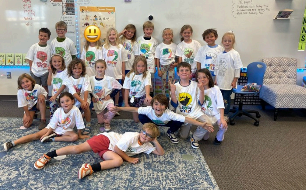
Annual Ophir Elementary 2 nd grade field trip

Clean.Drain.Dry. and PlayCleanGo are core to our youth education program. By understanding how to intentionally recreate outdoors from a young age, youth are better equipped to be a leader for conservation in their communities all while cultivating a love for recreating outdoors.