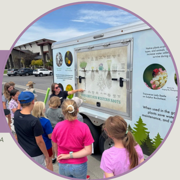
Summer camp with the Gallatin Valley YMCA