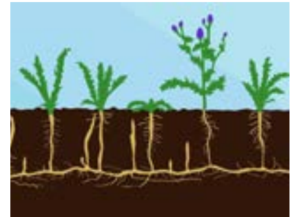
Creeping roots of Canada thistle