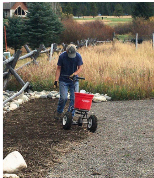
Volunteer seeding Idaho fescue at Crail Gardens, 2020