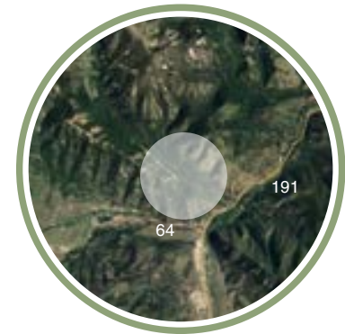
Spanish Peaks habitat